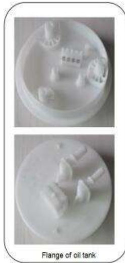
Flange of oil tank