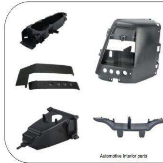
Automotive interior parts