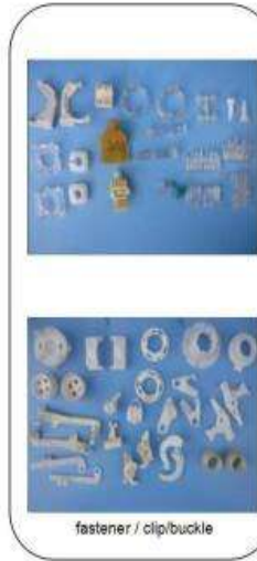
fastener / clip/buckle