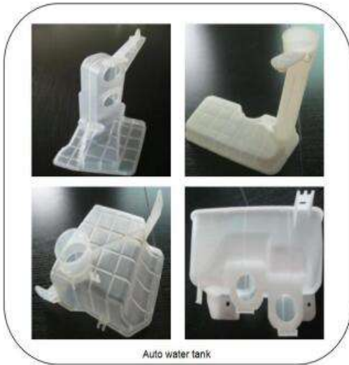
Auto water tank